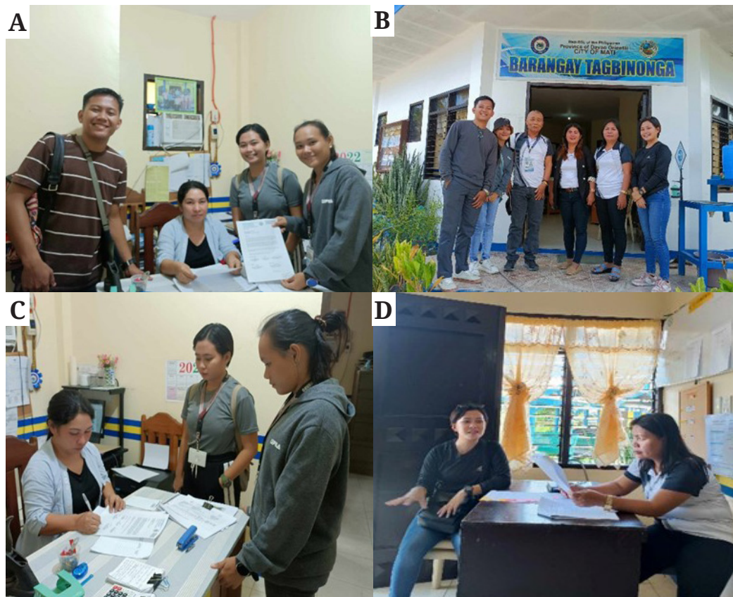
Figure 2. Data sampling in various barangays in Mati City selected for the study: Barangay Taguibo (A); Barangay Tagbinonga (B); Barangay Don Enrique Lopez (D).

After the respondents had answered the questionnaire, the same was retrieved, and the gathered data were scored using a 4-point Likert Scale, which was 4-Fully Aware, 3-Aware, 2-Unaware, and 1-Fully unaware. At the same time, regarding the performance of the Revitalized Pulis Sa Barangay , the researcher utilized this descriptive interpretation, which was 4-Very High, 3-High, 2-Low, and 1-Very Low. Participation was voluntary, and no participant was required to complete the survey.