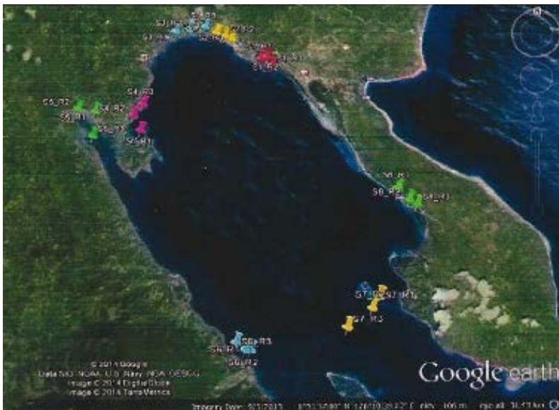
Figure 1. Established sampling stations in Pujada Bay.

The rate of sedimentation was established through the use of 1L plastic containers tied securely to a pole and placed in the shallow portions of the sampling sites for 24 hours. After retrieval of the sediment traps, samples were filtered and filtrates were air- or oven-dried and weighed.