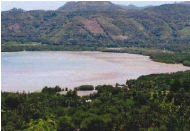
Figure 3. Aerial view of S5R2 site in Barangay Dawan where muddy sediments are amply deposited.

The three stations with relatively high rate of sedimentation were in S5R2 (21.74), S2R2 (15.43 and 8.21) and S3R1 (3.20). The S5R2 station is located within the Balite Bay area in Barangay Dawan (Figure 3). This coastline is the catch basin of the eroded soil as a result of soil extraction activities upland. This extremely high rate of sedimentation was more pronounced due to heavy downpour of rain a day before the first sampling. The sedimentation in the area is so bad that it is still visible for a few days even without rain. Station 5 in Barangay Dawan is heavily silted (Figure 3). On the other hand, S2R2 is situated near the coastal residential area of Magsaysay which is close to the mouth of Mati Creek, slaughter house and dockyard where presence of several anthropogenic activities had contributed to its sediment load. The sediment level at S3R1 in barangay Bilawan and Magapo might be attributed to the various “fish landing activities” in the area. Moreover, S3R1 is adjacent to Sudlon Creek’s discharge to the bay.